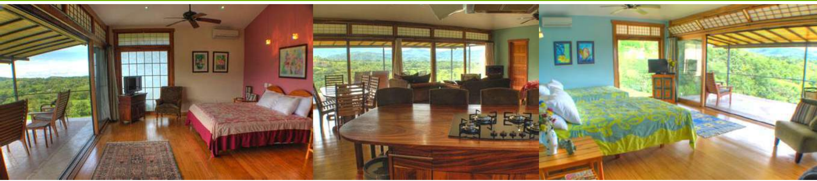
Cabins 4 - 6 >> Villa B