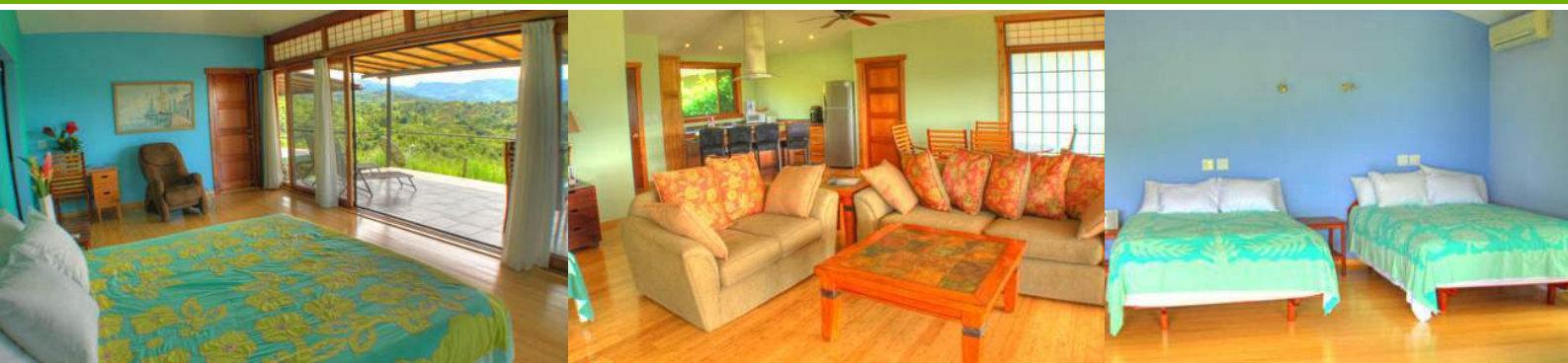
Cabins 7 - 9 >> Villa C