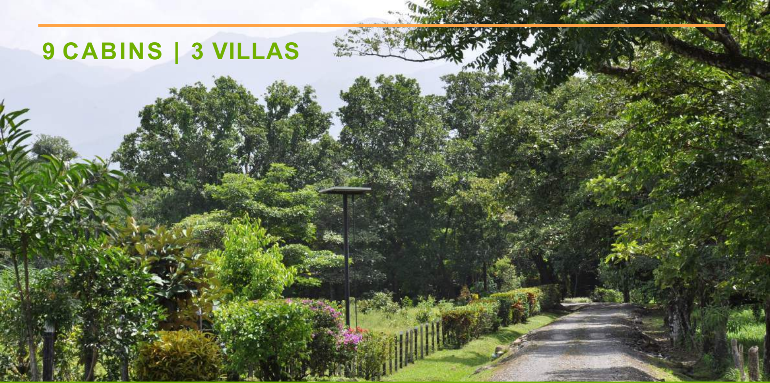
Cabins 1 - 3 >> Villa A